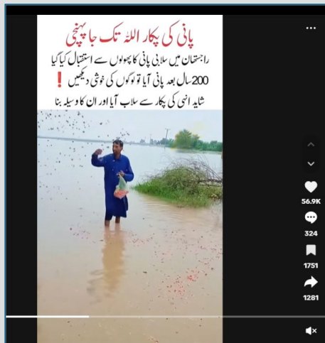
Figure 3 One message caption claimed the flood was divine reward for desert communities

with fatalistic ones, creating competing moral messages that shape climate response behaviour among vulnerable Indigenous communities. These messages framed floods, cloudbursts and glacial lake outbursts as divine retribution for moral failings such as corruption or perceived social immorality. In other instances, some messages also framed extreme weather events as divine reward. The narrative frame validates past research, which has found religious fatalism in peasant populations regarding floods. 74 Such fatalistic readings risk discouraging preventive action and reinforcing the idea that floods, heatwaves or glacial disasters are beyond human influence, rather than partially driven by governance failures, land-use decisions and global emissions.