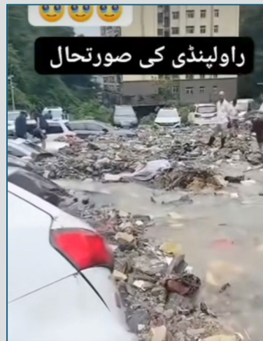
Figure 1 One misleading post used past floods visuals from China to make a claim about floods destruction in Rawalpindi

A striking 70% of the identified climate disinformation messages had an alarmist tone using fear and emotional exaggeration to drive engagement. This aligns with common social media algorithms that reward sensational content, furthering virality.