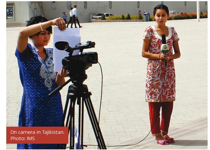
On camera in Tajikistan.

To ensure greater impact through joint efforts, we work in partnership with local media and like-minded international organisations.