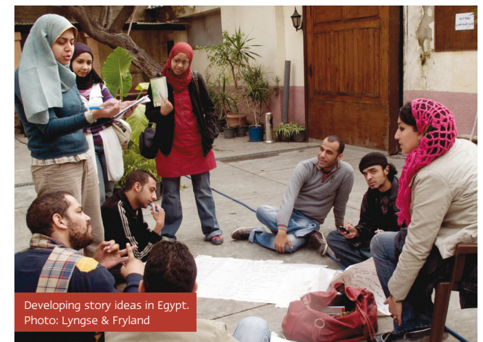
Developing story ideas in Egypt.