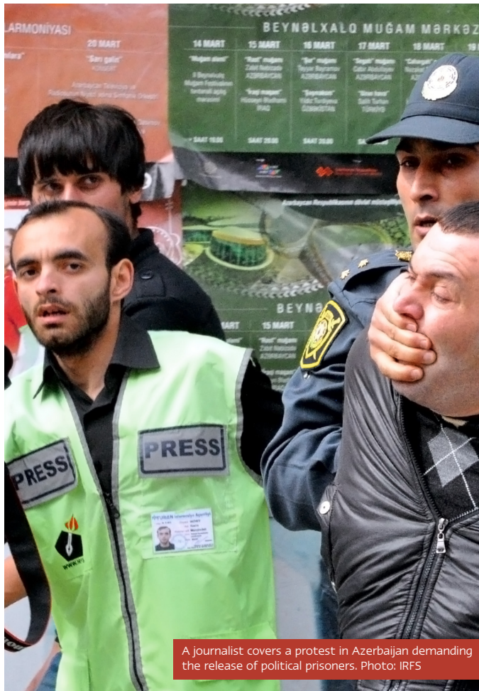
A journalist covers a protest in Azerbaijan demanding the release of political prisoners.