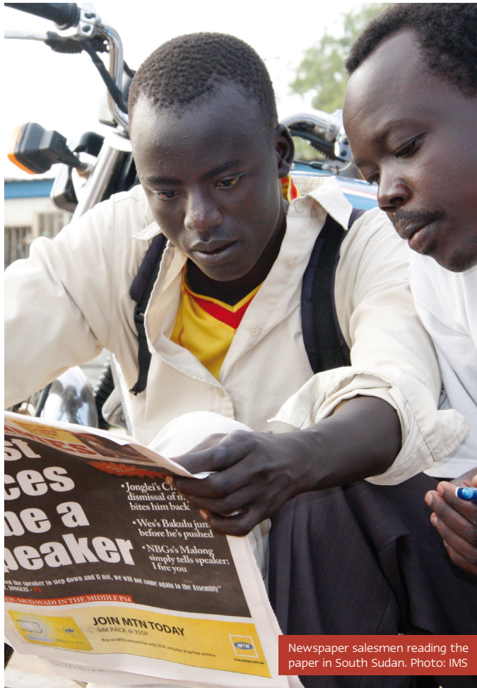
Newspaper salesmen reading the paper in South Sudan.