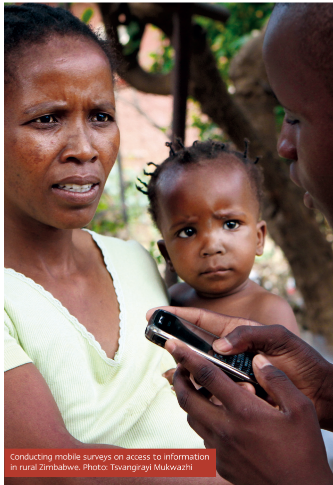
Conducting mobile surveys on access to information in rural Zimbabwe.