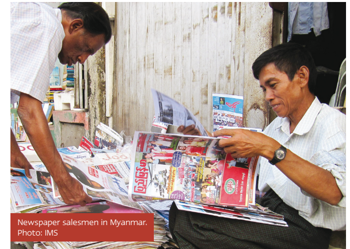
Newspaper salesmen in Myanmar.