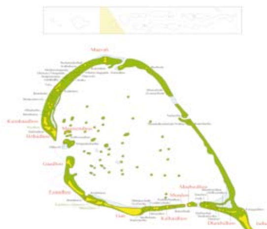
Map of Laamu Atoll:

The atoll had a self-sufficient economy until 1970s and it remains relatively developed compared to neighbouring atolls with a large population. The biggest industries are fishing and agriculture (mango and rice), but an increasing number of people combine a service sector job with a small agricultural livelihood project. Around 20% of the population is employed in regular service jobs, and the rest work in fishing or farming. The youth tend not to be very interested in fishing and farming, but prefer office or security-related jobs, partly because fishing is a seasonal business. Tourism has not traditionally been a big sector on Laamu Atoll but the first tourism resort, 'Six Senses' located on Olhuveli Island, is due to open in early 2010, creating new employment opportunities.