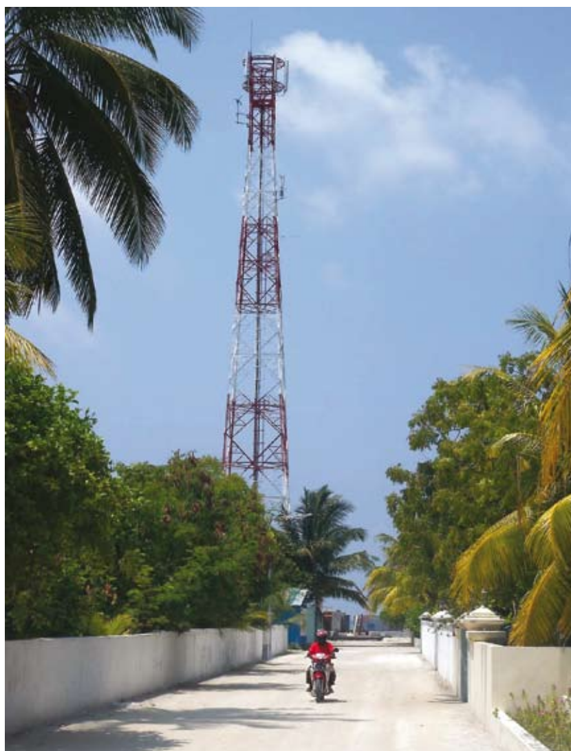
All inhabited Islands have coverage via antenna towers such as this, located on a main road in Gan-Fonadhoo, Laamu Atoll.

Operational management of Dhiraagu has been and remains with C&W but, at the national level, Dhiraagu is managed by Maldivians. These managers, who are well-trained and professional, made it clear that only the company business plan and major procurement decisions require approval by C&W headquarters in London. At the same time, the company benefits from sharing experience with other C&W operations and from access to C&W training facilities.