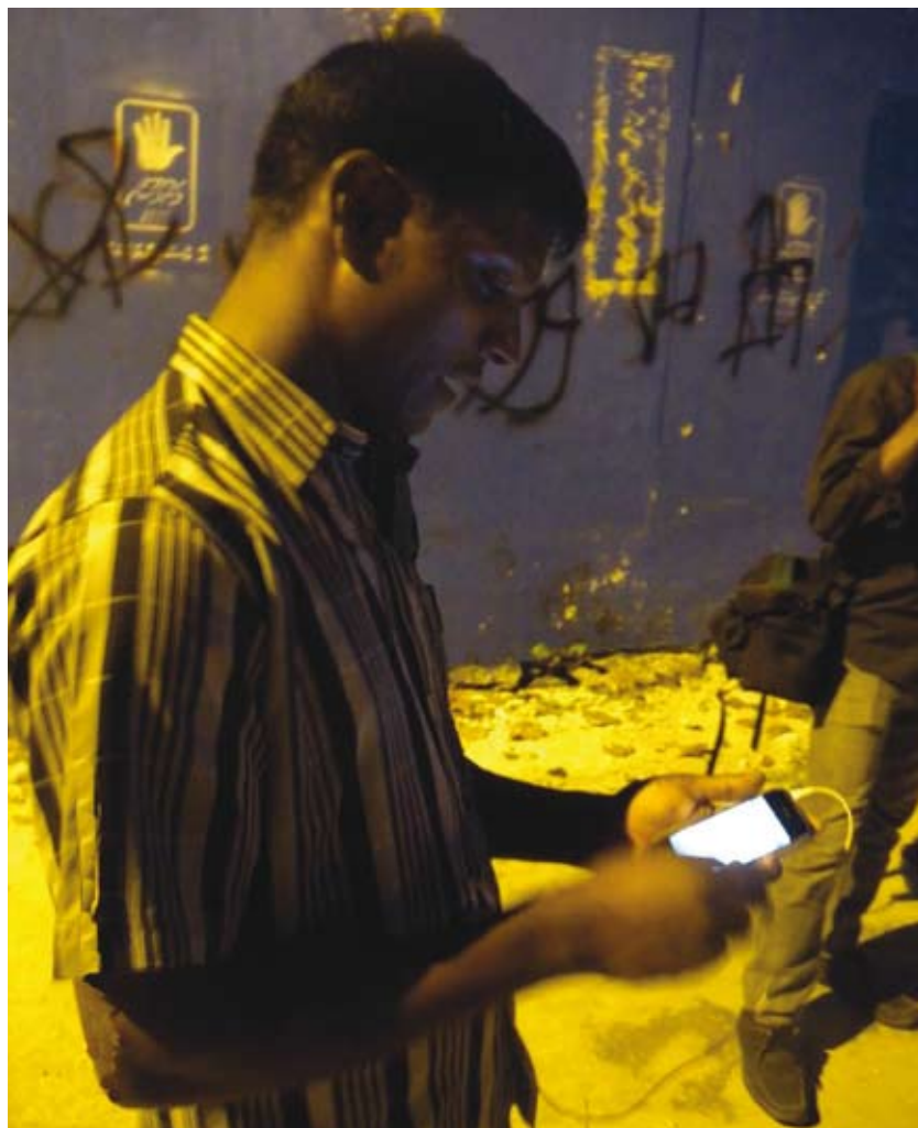
Even remote Islands have mobile coverage enabling people to access the internet via mobile phones like this Island officer checking Facebook using his iPhone on Maabhaiddoo Island.

Small businesses and citizens in the Maldives have shown a strong interest in using ICTs. Internet use in Malé is extensive and innovative (including content generation). There does not seem to be much need to stimulate demand or to raise awareness where applications and services are available which have value for citizens and businesses.