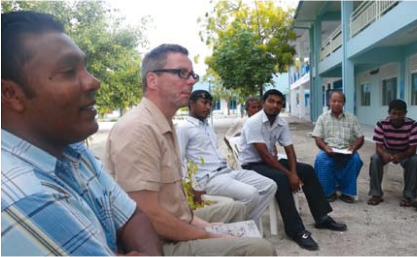
The assessment team used a variety of methods to uncover media and ICT usage here through a focus group discussion with NGOs and community groups in Gan-Fonadhoo.

government, such as email and Internet services, with the dual aim of enhancing internal communications and providing the public with information and services on-line. As of the end of 2009, this component is still being implemented. Three main portals will be created – the government to government portal (G2G), the government to citizen portal (G2C) and the government to business portal (G2B) – to streamline navigation. The G2G portal will function as a government intranet, while the G2C and G2B portals will be single window entry points for citizens and businesses, respectively.