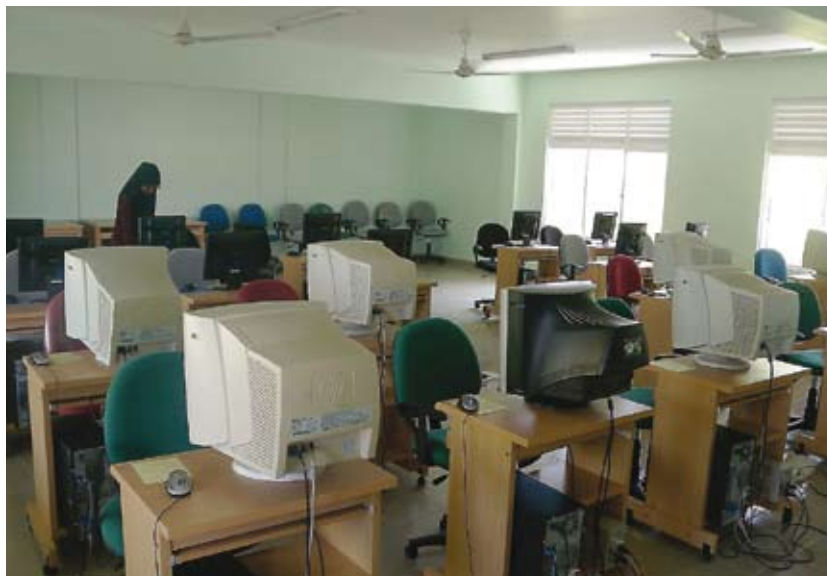
ICT learning centre at one of the schools on Gan-Fonadhoo Island.

Overall development of the main internal networks has been largely determined by Dhiraagu, as the former monopoly and dominant operator. It has focused on three main objectives.