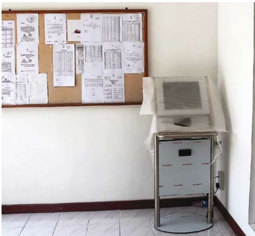
An Internet Service Kiosks – not yet in use – for e-Government services at the Government Atoll Office.