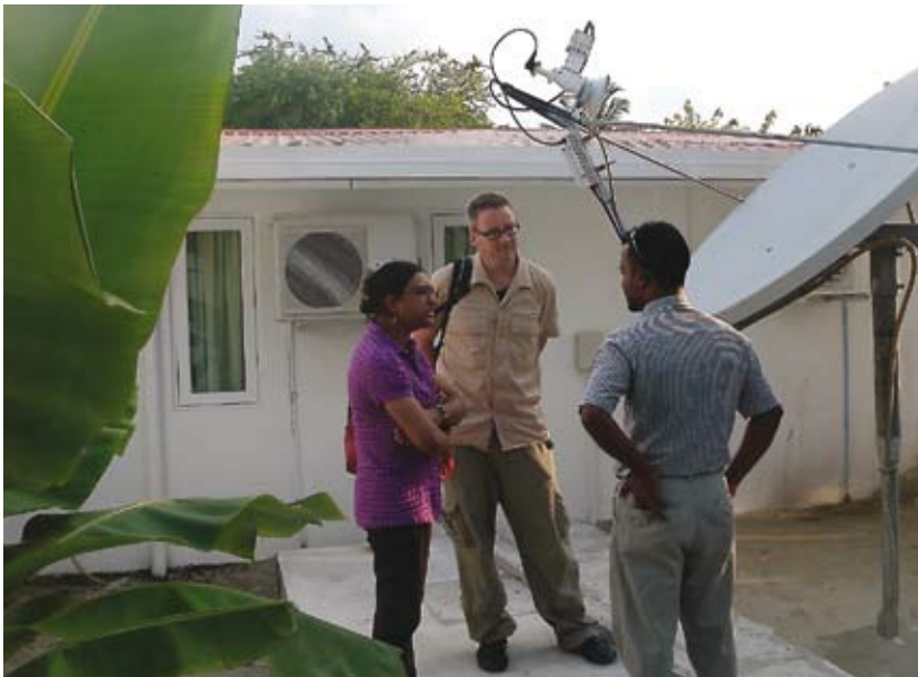
Some public buildings like this hospital connect via VSAT dish.

As noted above, the mobile market is highly saturated, with about 1.5 subscriptions/SIMs per capita. There are several potential reasons why the number of phones substantially exceeds the number of phone users: because of differences in connectivity to different locations (users may need two