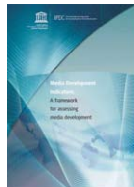
The Media Development Indicators report published by UNESCO.

CATEGORY 5: infrastructural capacity is sufficient to support independent and pluralistic media: the media sector is characterised by high or rising levels of public access, including among marginalised groups, and efficient use of