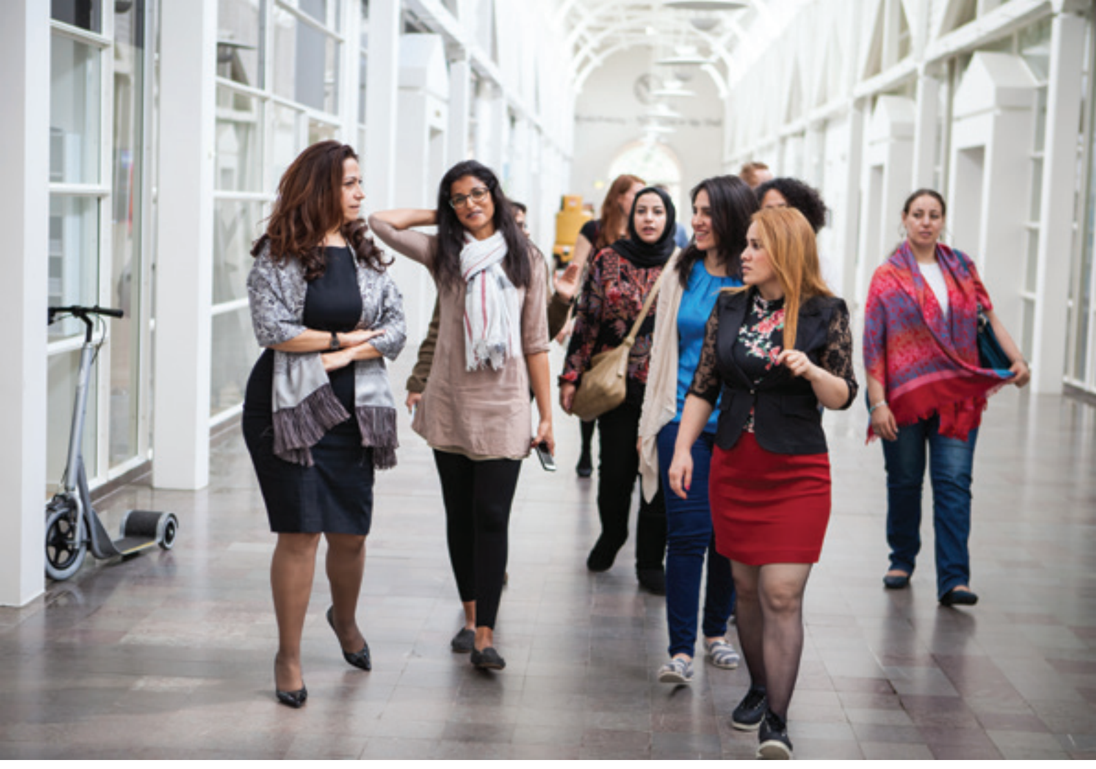
"Challenging male dominance in the media" was a weeklong roadtrip organised as part of IMS' crosscutting peer-to-peer programme which fosteres exchange of experience and skills between Arab and Danish media professionals. The photo features the visit of seven media workers from Jordan, Yemen, Egypt, Lebanon and Iraq to Denmark.

As the glaring lack of parity in the way men and women access, participate in and are portrayed by media becomes increasingly evident, IMS' gender approach – whereby we not only promote gender equality within the media, but also media's contribution to gender equality – comes to the fore.