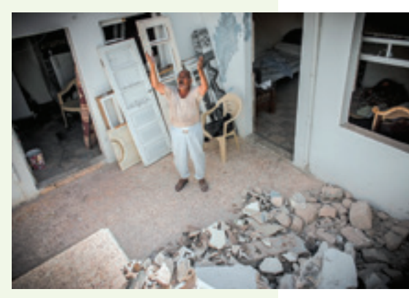
A man stands in a bombed building in the Syrian town Azaz outside Aleppo.

The bombings and endless attacks make it nearly impossible to