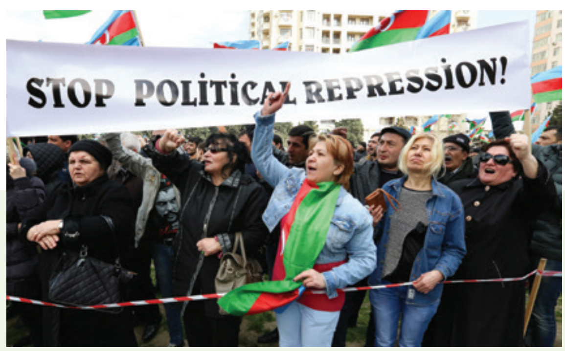
"Stop political repression," reads a banner during an opposition rally in Baku, Azerbaijan in April 2015.