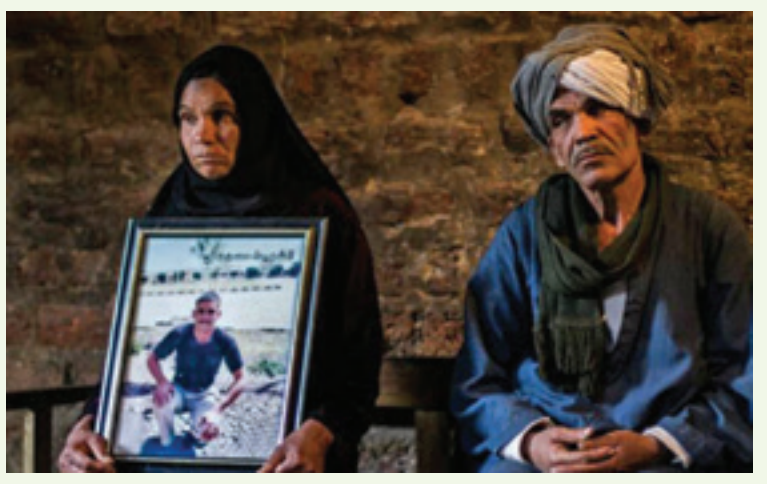
Parents of a recruit who died under the authority of the Egyptian Central Security Forces.

over real estate ownership from thousands of Syrians who had fled the country through forged documents. As a result of the investigation, the Ministry of Justice in Syria started archiving 10 million house deeds and land titles.