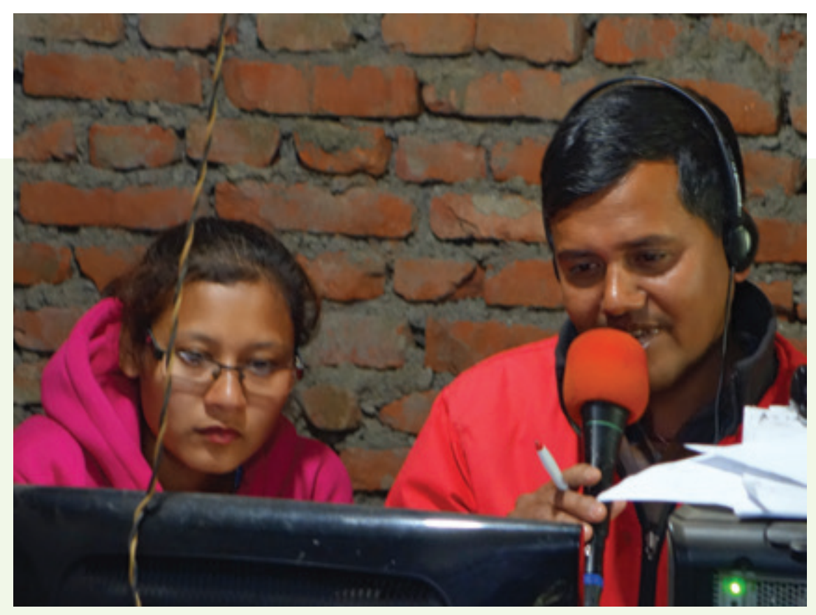
Radio Sindhu, a community radio in Chautara, one of the areas most affected by the earthquake.