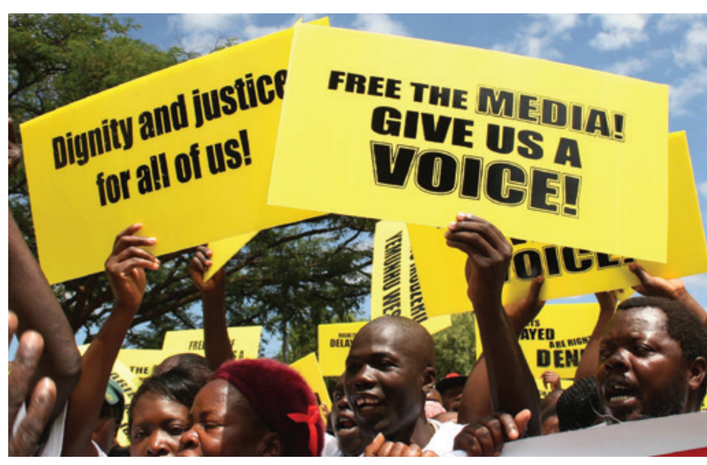
Demonstrators in Harare commemorate the international human rights day on 10 December.

IMS' work in 2015, was raising awareness of the effect of gender discrimination in media products, as well as access, participation and portrayal of men and women in the media. All this with a view for partners to develop gender policies, action plans and integrating gender considerations in programmes.