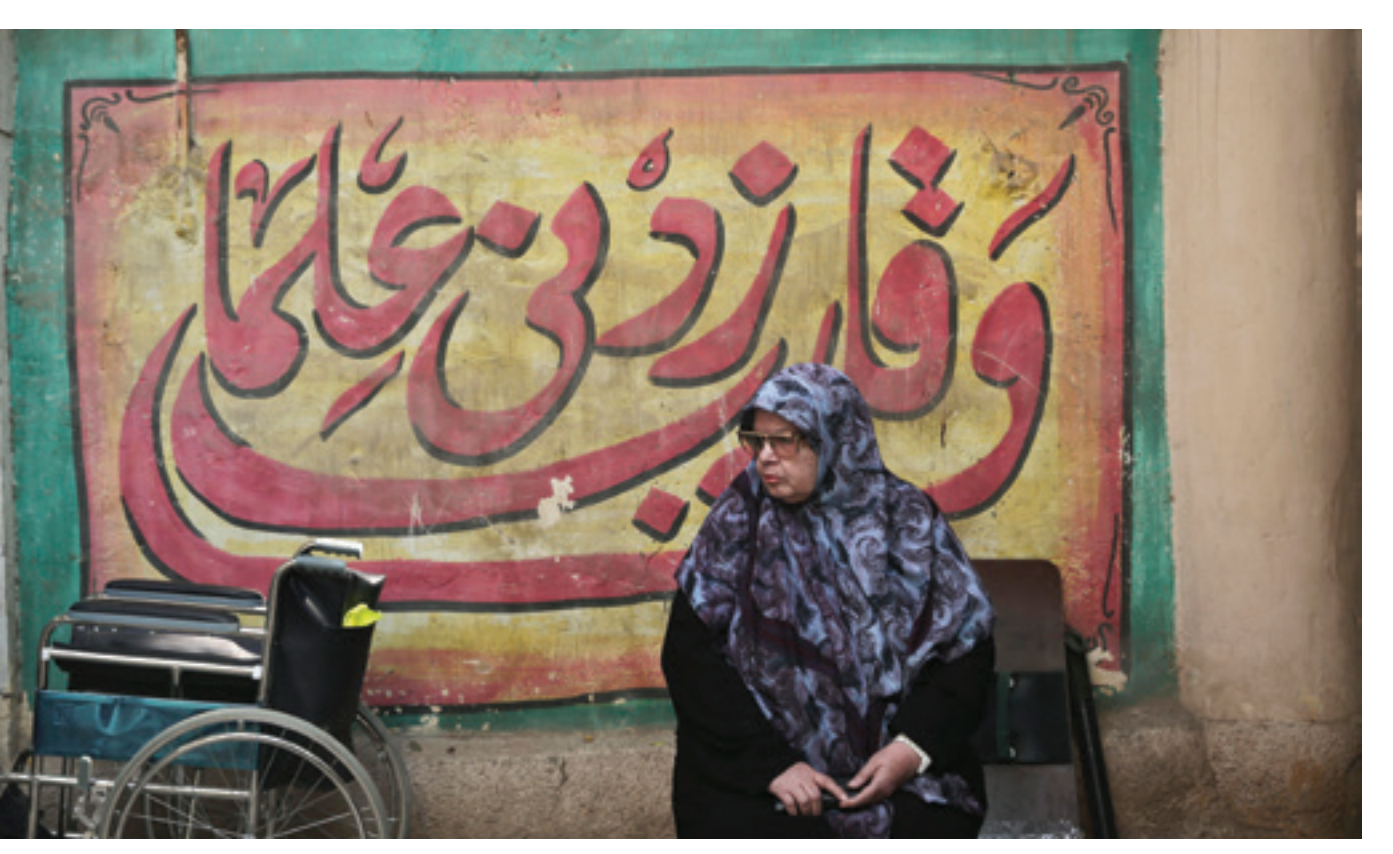
An Egyptian woman waits for an election worker to check her identification card inside a polling center during the second phase of the parliamentary election, in the Maadi district of Cairo, Egypt. Arabic on wall of school reads "Give me more knowledge".

In the region's gloomy setting for independence and innovation, Tunisia's collective blog platform, Nawaat continued to provide a glimmer of hope, providing investigative reports and opening the space for a variety of opinions and debates. Our work with Nawaat enabled them to strengthen