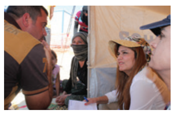
A journalist from Zhin Magazine interviews residents in a refugee camp close to Sulaymaniyah in Iraqi Kurdistan.

needs and working conditions of female journalists in Afghanistan, "The Reporting Heroes", published by the Afghan Journalists' Safety Committee in March 2016 with IMS support. The study highlights that in addition to the risks that all media workers face working in conflict-ridden countries, female journalists are often intimidated and threatened simply because of their profession and gender. Extremist religious groups opposed to women working outside the home are those most commonly responsible for these threats and intimidations against female journalists.