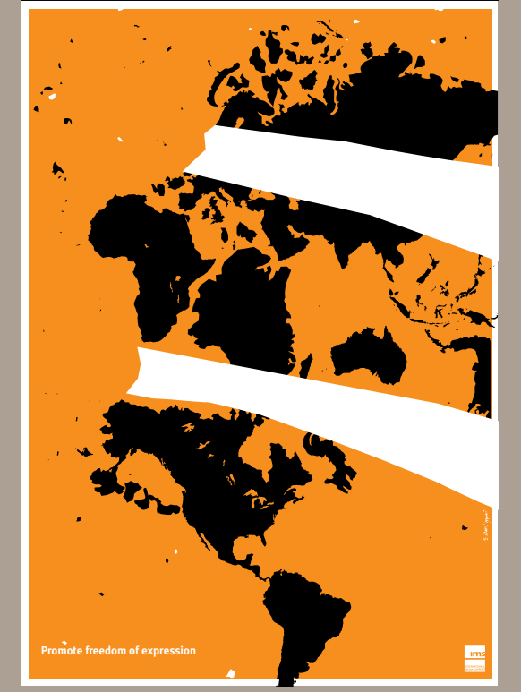
IMS poster on press freedom by Danish artist Finn Nygaard

IMS produced a broad range of publications in 2010 which included assessments of the press freedom and media situation in Yemen, Honduras and Sri Lanka as well as two reports on the