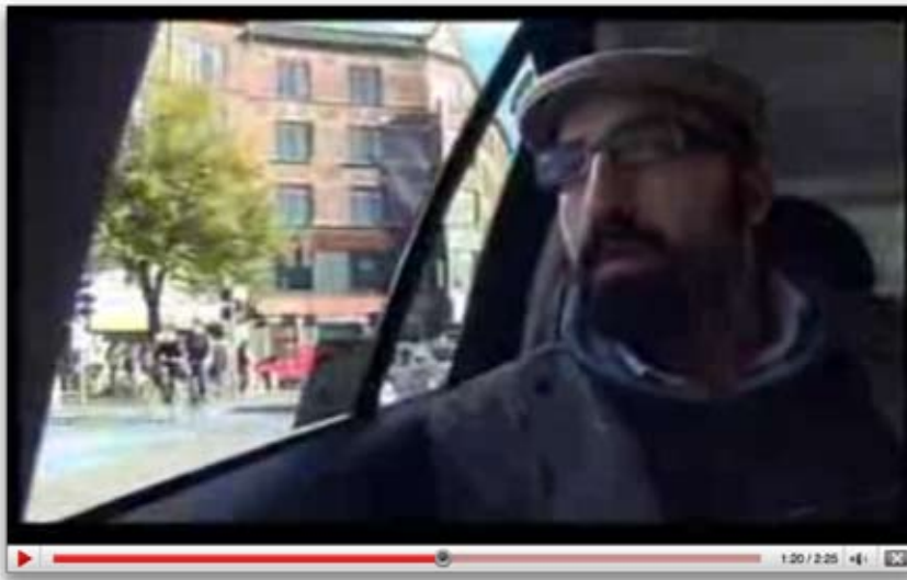
Screenshot from documentary "An Arab comes to town" by Georg Larsen

Subsequently, all of the five Danish productions were screened at international film festivals including: Nordisk Panorama (Sweden), Viscult 2008 (Finland), Curta Cinema (Brazil), Reykjavik Shorts and docs Film Festival (Iceland) and IDFA 21th International Film Festival Amsterdam (Holland). In addition to this an effort is in progress to have the productions screened at Middle Eastern film festivals.